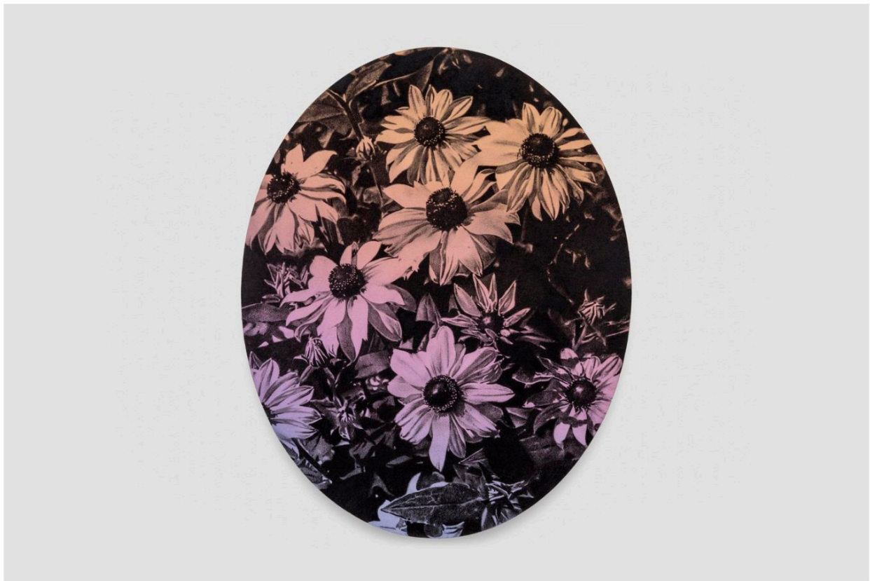
Depending On the Weather

than present the scene in full color or in black and white, Mister draws this mountain in black and white against a light pink ground. Nepal 1 and Nepal 3 also depict mountain peaks against white and light blue backgrounds. Across the wall from the mountains are drawings of ocean waves all titled An Invisible Terrain (1-4), most likely named after the book, Invisible Terrain: John Ashbery and the Aesthetics of Nature , where Ashbery questions how “nature, not art might usurp the canvas.” In Mister’s images, crashing waves are juxtaposed with cloud-filled skies drawn in detailed black and white against colorful gradients that come across as more surreal than identifiable.