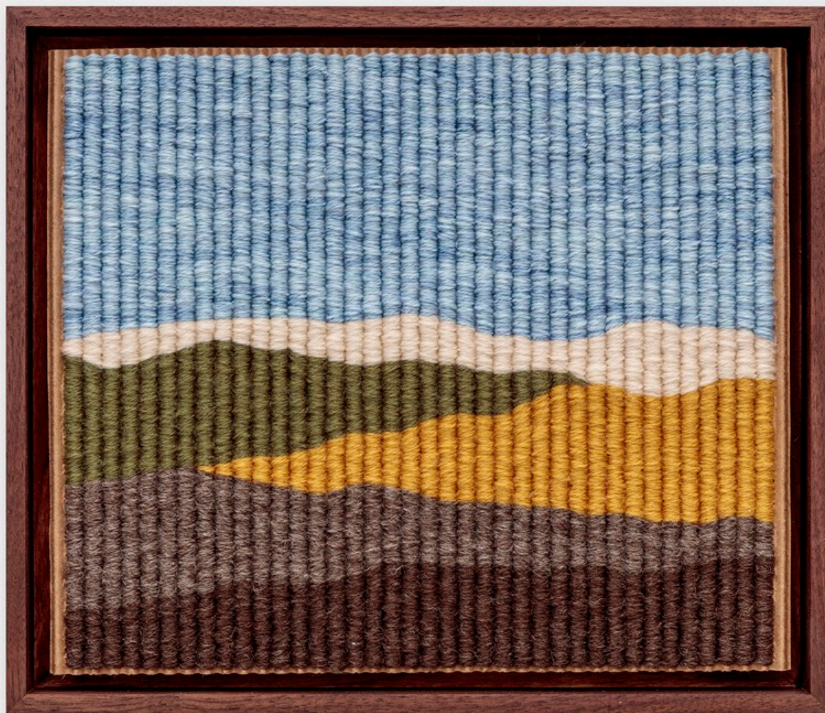
Amy Kim Keeler If This Isn't Love , 2024 Wool on corrugated cardboard 8.25 x 10 in / 20.96 x 25.40 cm Framed: 9.50 x 11 in / 24.13 x 27.94 cm AKK-23