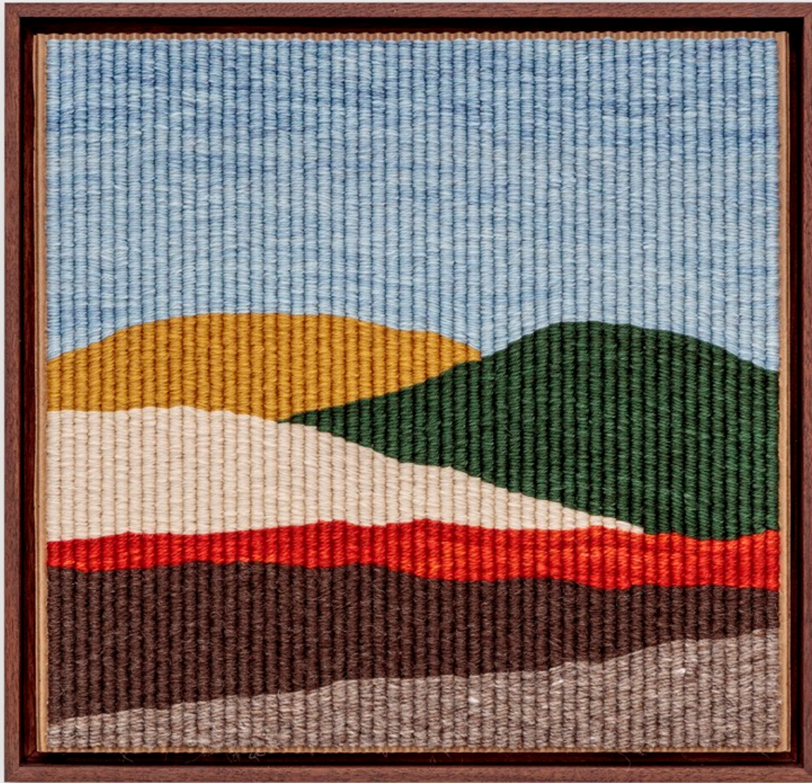
Amy Kim Keeler Maybe There , 2023 Wool and silk on corrugated cardboard 13.40 x 14.25 in/ 34.04 x 36.20 cm Framed: 14.50 x 15.25 in / 36.83 x 38.74 cm AKK-21