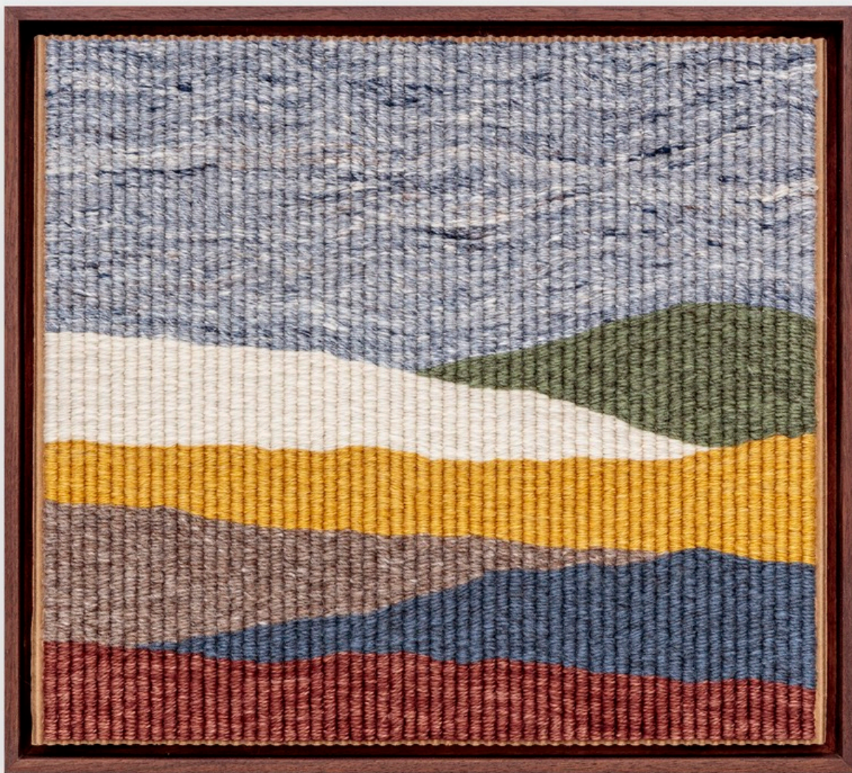
Amy Kim Keeler Homebound , 2023 Cotton, wool, silk, and viscose on corrugated cardboard 13.50 x 15 in / 34.29 x 38.10 cm Framed: 14.50 x 16.25 in / 36.83 x 41.28 cm AKK-19