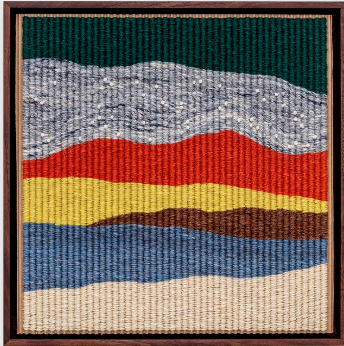
Amy Kim Keeler Ask the Sea for Answers , 2023 Cotton, wool, silk, linen, nettle, and viscose on corrugated cardboard 12.50 x 12.50 in / 31.75 x 31.75 cm Framed: 13.75 x 13.75 in / 34.93 x 34.93 cm AKK-20