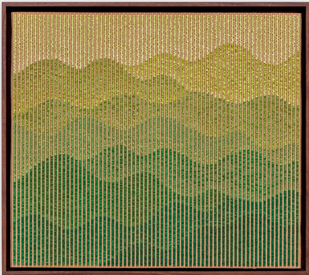
Amy Kim Keeler The Last Thing I Saw , 2023 Cotton and wool on corrugated cardboard 15.75 x 18 in / 40 x 45.72 cm Framed: 17 x 19.25 in / 43.18 x 48.90 cm AKK-25