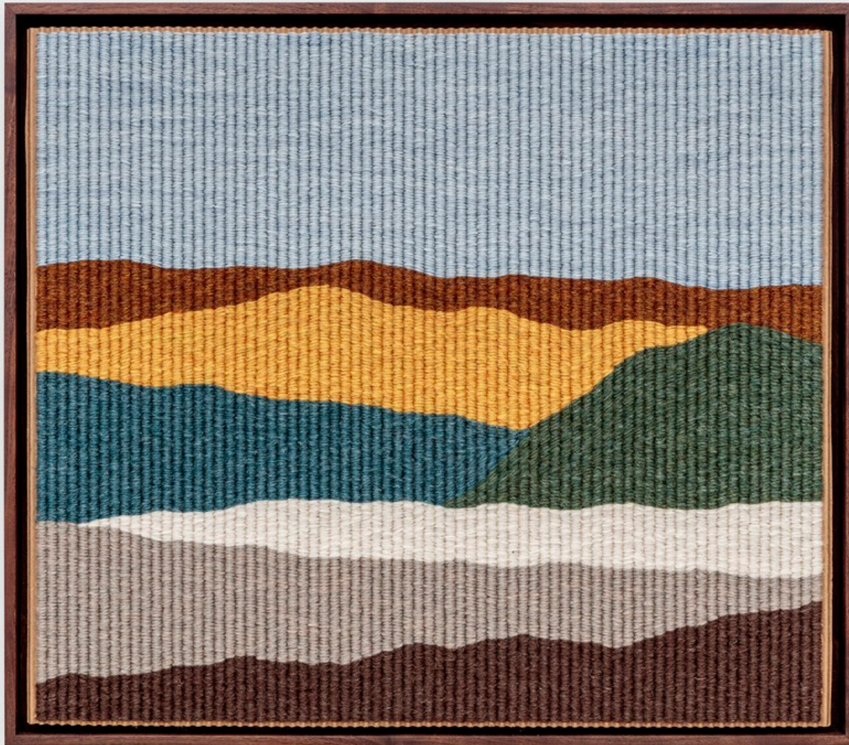
Amy Kim Keeler Carry On Without Me , 2023 Cotton, wool, silk, alpaca, linen, alpaca, and nettle on corrugated cardboard 16.75 x 19.50 in / 42.54 x 49.53 cm Framed: 18 x 20.50 in / 45.72 x 52.07 cm AKK-17