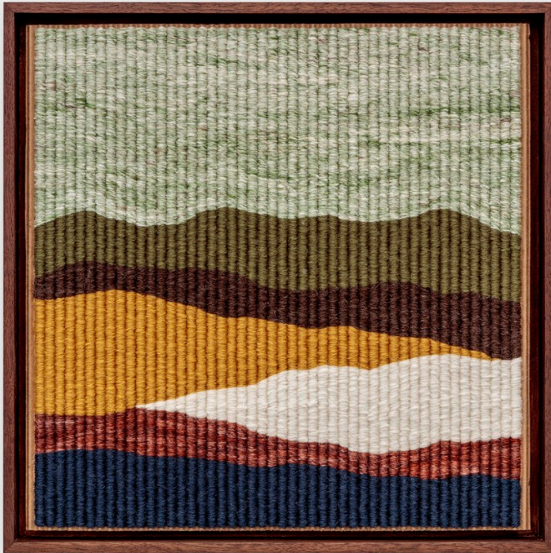
Amy Kim Keeler Voices Carry , 2024 Cotton, wool, silk, and viscose on corrugated cardboard 12.50 x 12.50 in / 31.75 x 31.75 cm Framed: 13.75 x 13.75 in / 34.93 x 34.93 cm AKK-22