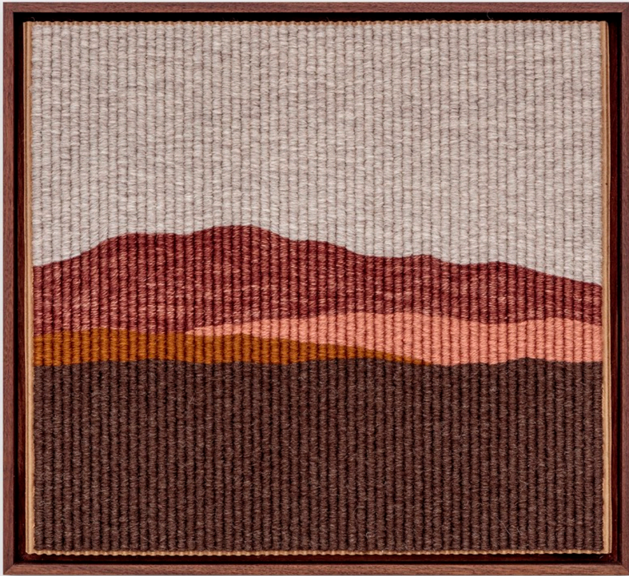
Amy Kim Keeler Doctor, My Eyes Have Seen the Years 2023 Wool on corrugated cardboard 14.25 x 15.50 in / 36.20 x 39.37 cm Framed: 15.25 x 17 in / 38.74 x 43.18 cm AKK-18