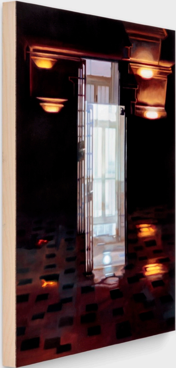
Patti Oleon, White Doorway (side view), 2023