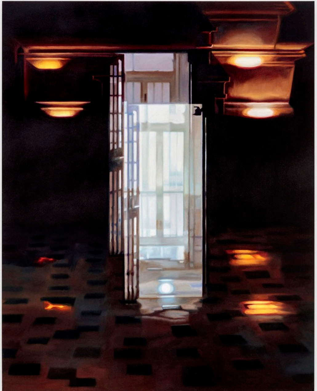
Patti Oleon White Doorway 2023 Oil on hardwood panel 30 x 24 in 76.20 x 60.96 cm PO-06