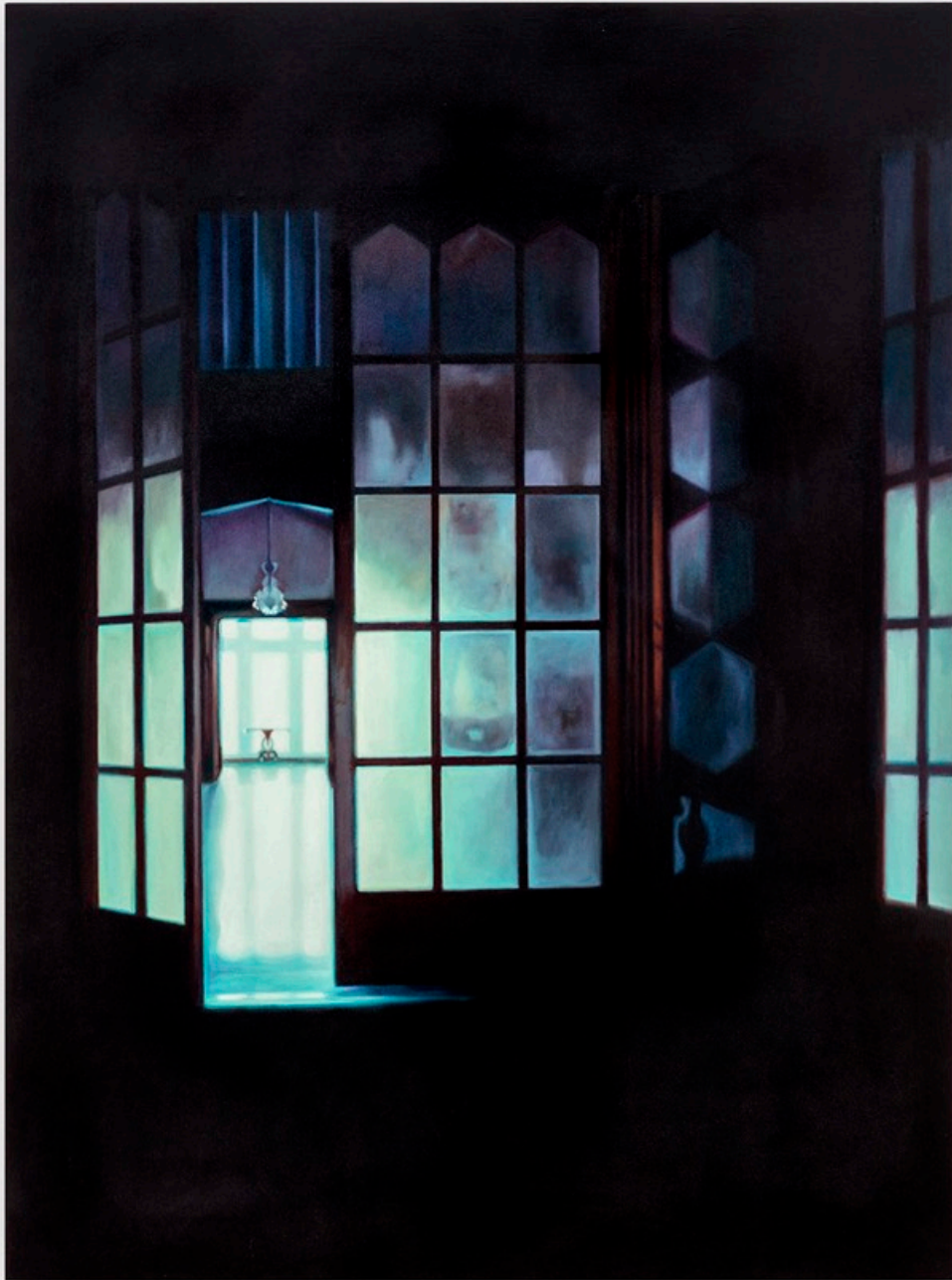
Patti Oleon Blue Light 2024 Oil on hardwood panel 40 x 30 in 101.60 x 76.20 cm PO-02