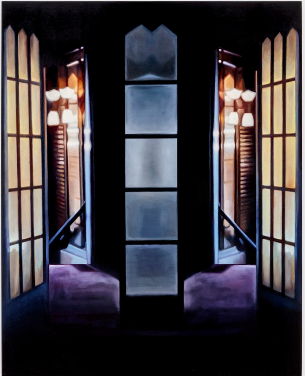
Patti Oleon Kiosk II 2024 Oil on linen over wood panel 30 x 24 in 76.20 x 60.96 cm PO-08