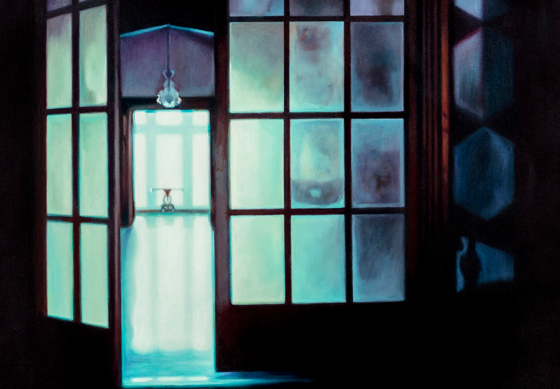
Patti Oleon, Blue Light (detail), 2024