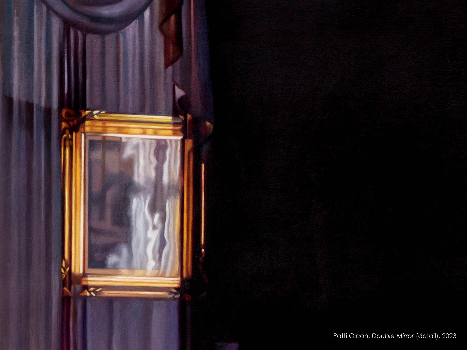
Patti Oleon, Double Mirror (detail) , 2023