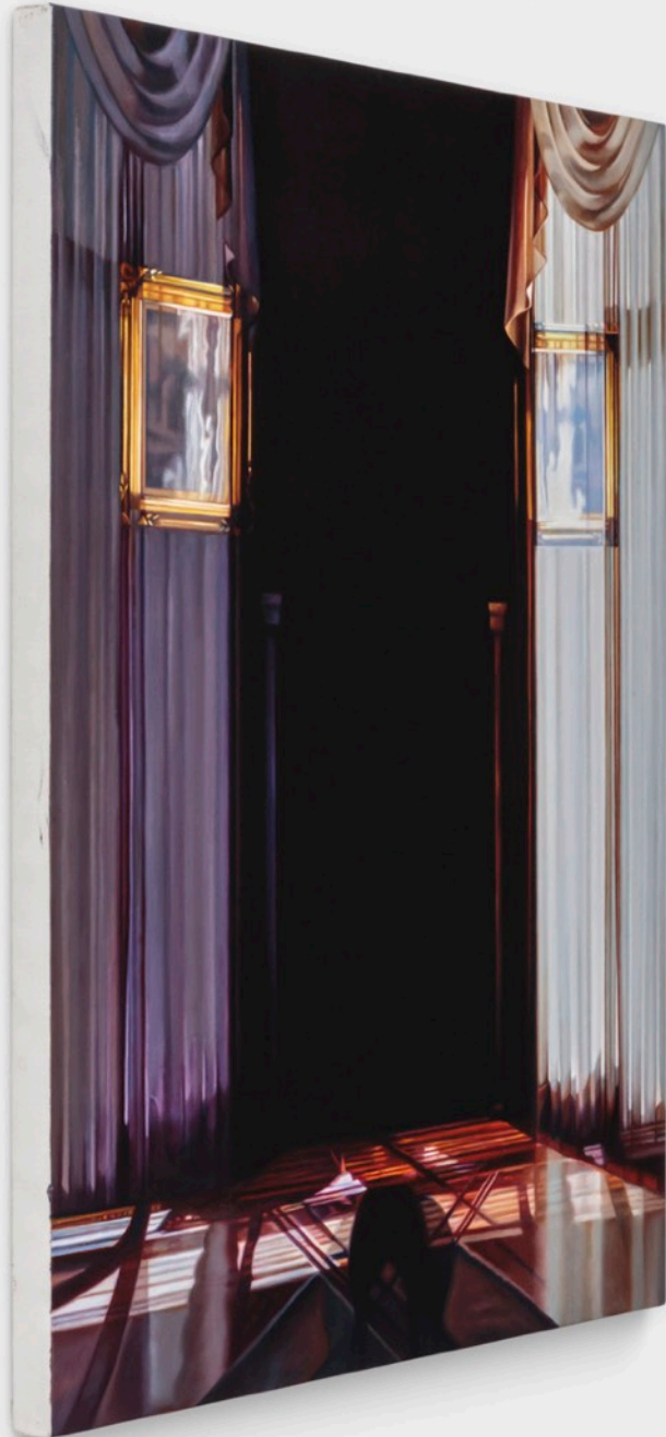
Patti Oleon, Double Mirror (side view), 2023