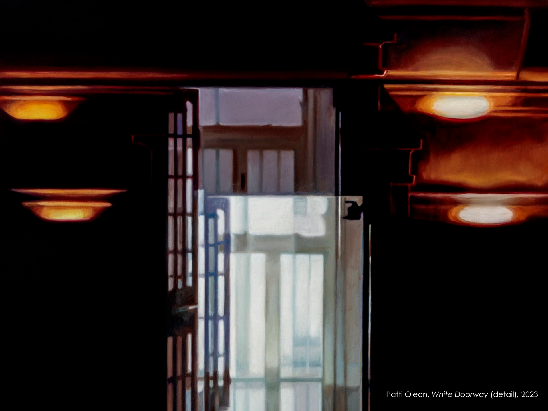
Patti Oleon, White Doorway (detail), 2023