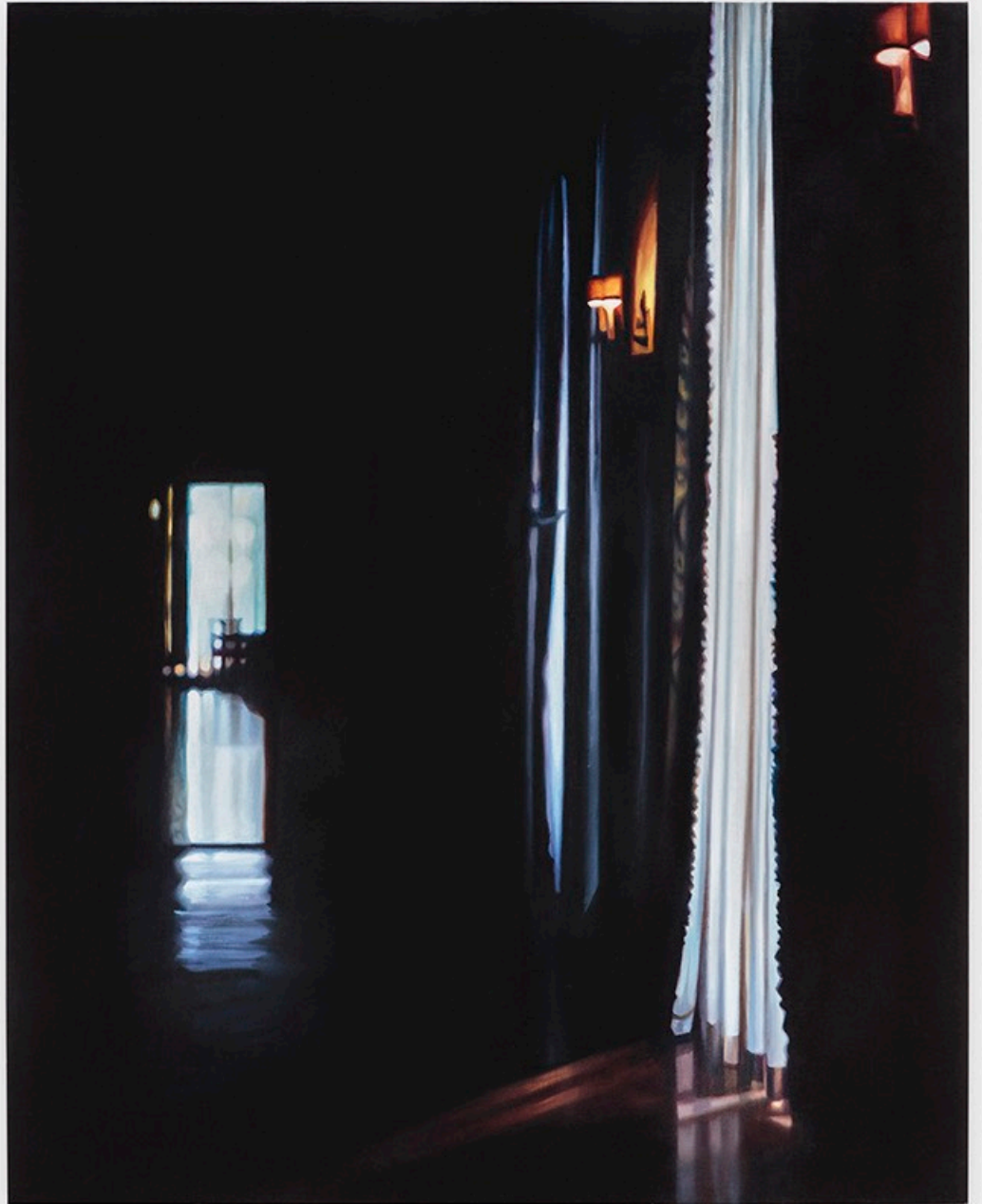
Patti Oleon Black Hallway 2024 Oil on linen over wood panel 30 x 24 in 76.20 x 60.96 cm PO-07