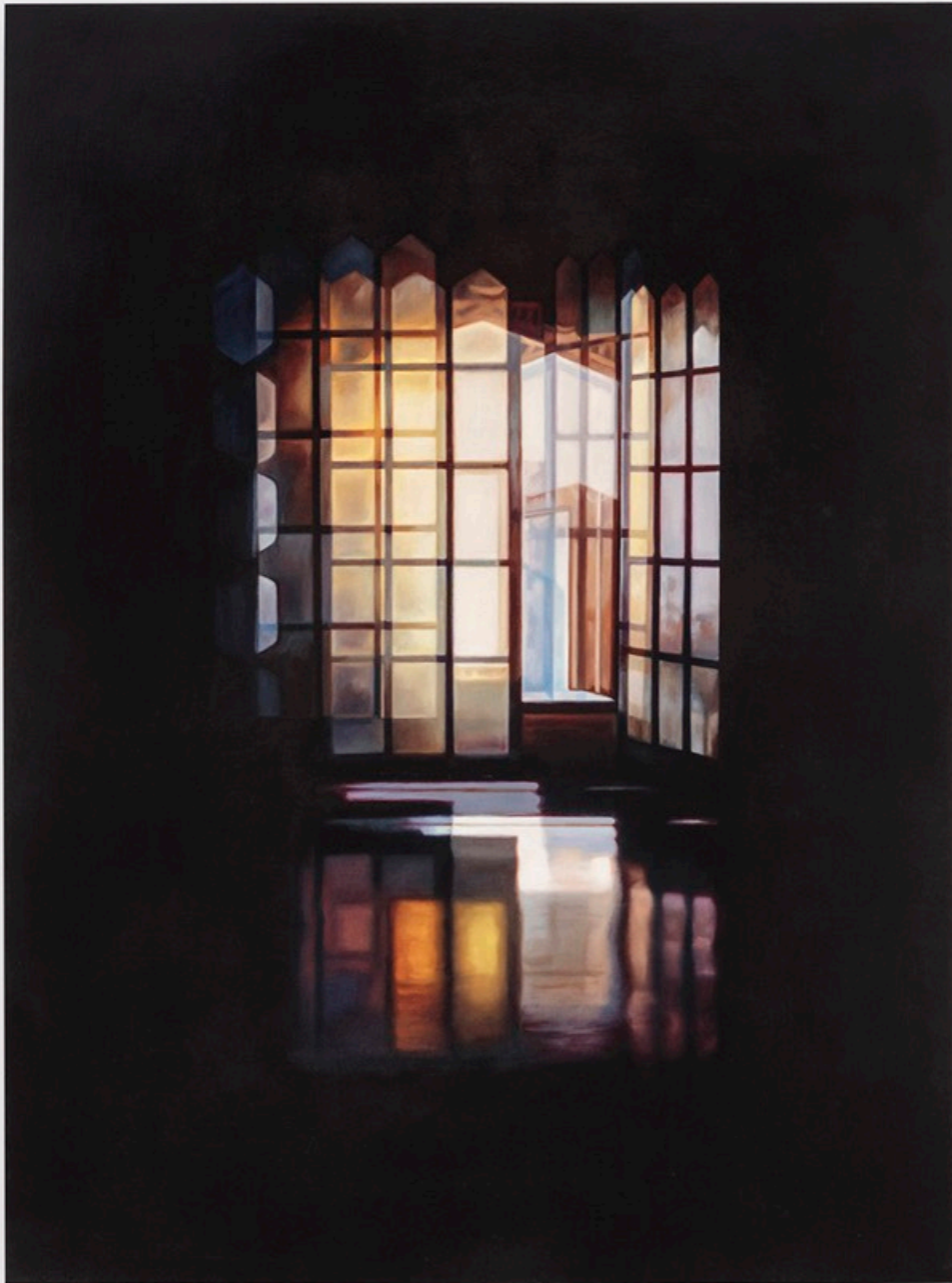
Patti Oleon Faceted Doorway 2023 Oil on hardwood panel 40 x 30 in 101.60 x 76.20 cm PO-04