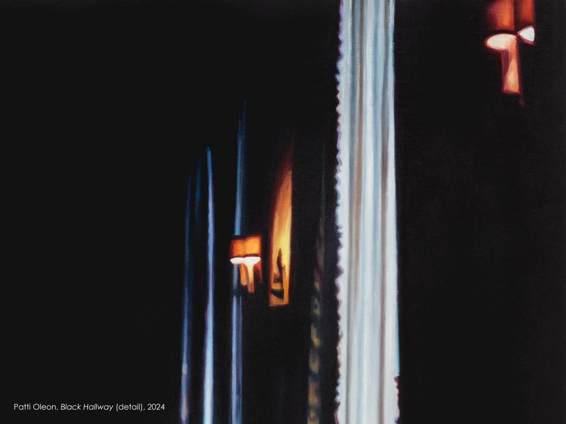
Patti Oleon, Black Hallway (detail), 2024