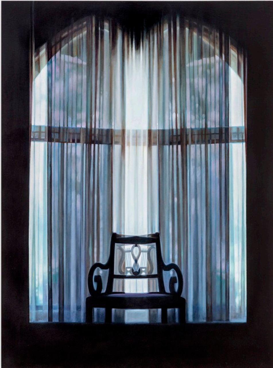
Patti Oleon Curtained Window 2024 Oil on hardwood panel 40 x 30 in 101.60 x 76.20 cm PO-05