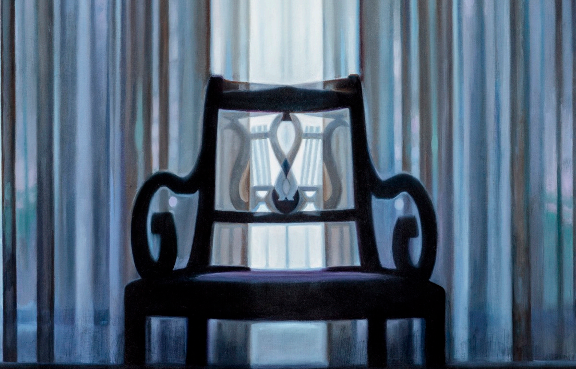
Patti Oleon, Curtained Window (detail) , 2024