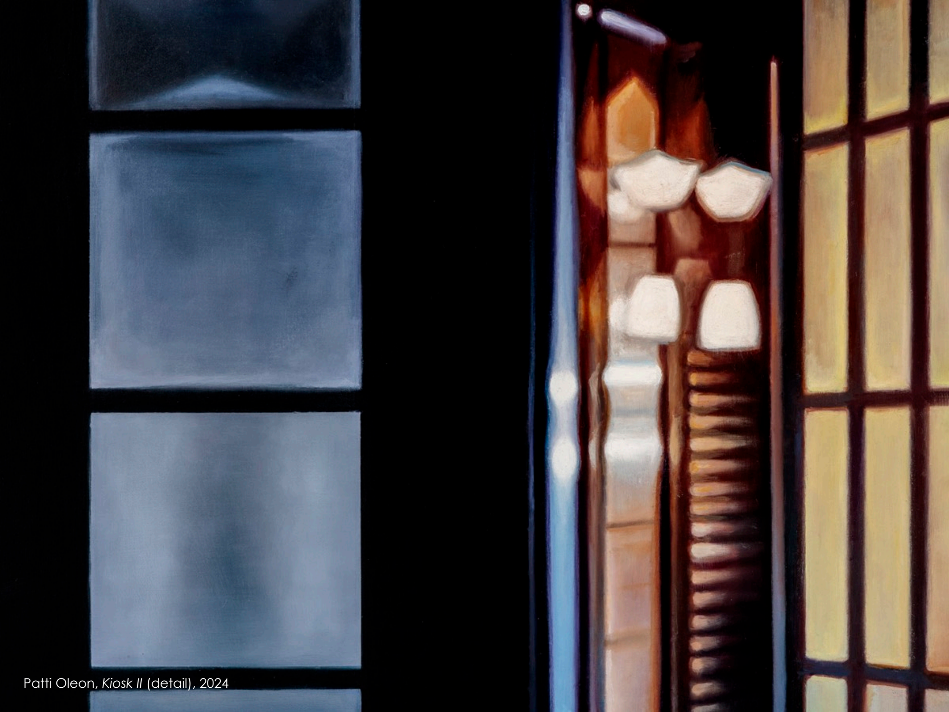
Patti Oleon, Kiosk II (detail), 2024