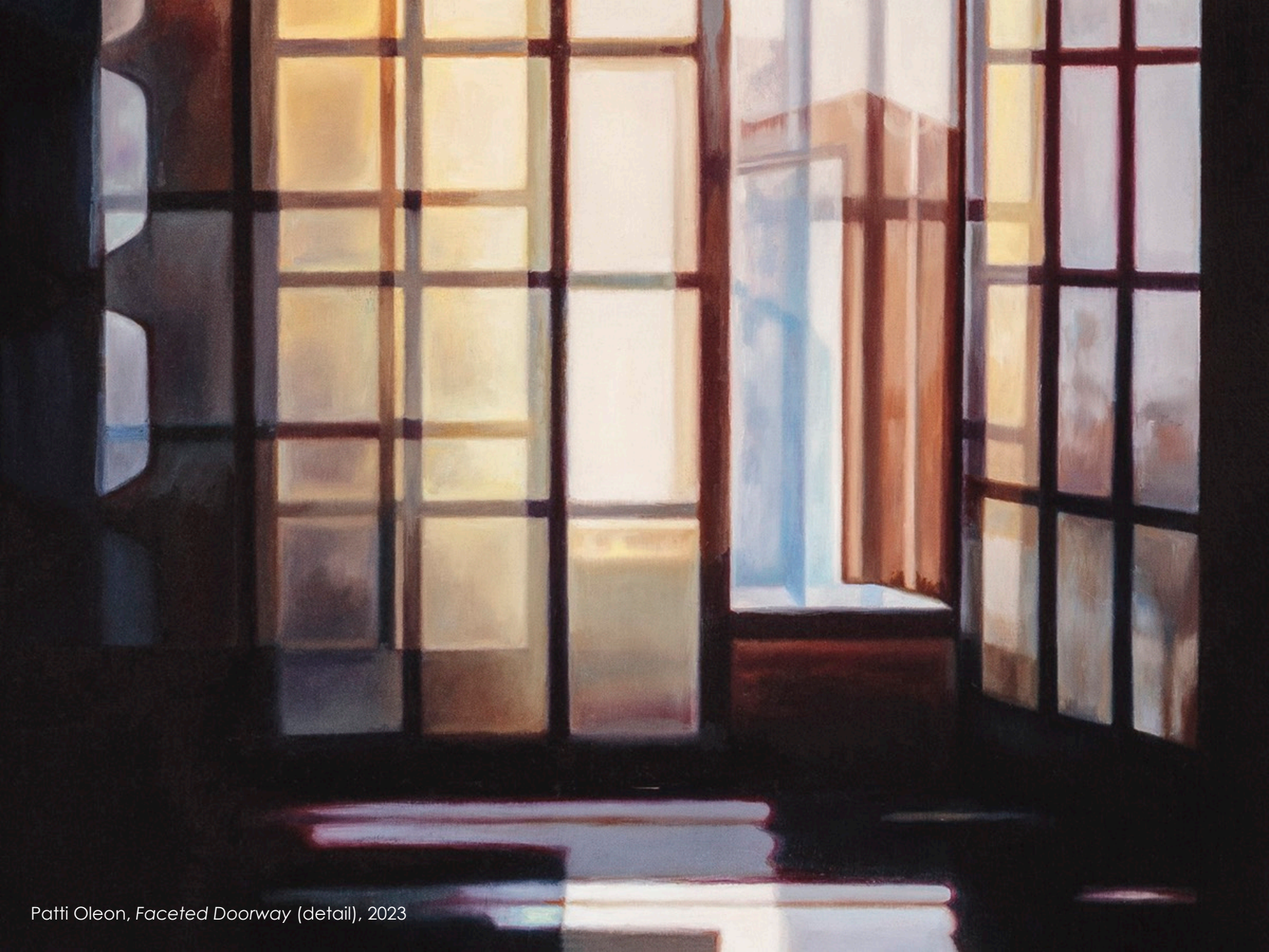
Patti Oleon, Faceted Doorway (detail), 2023