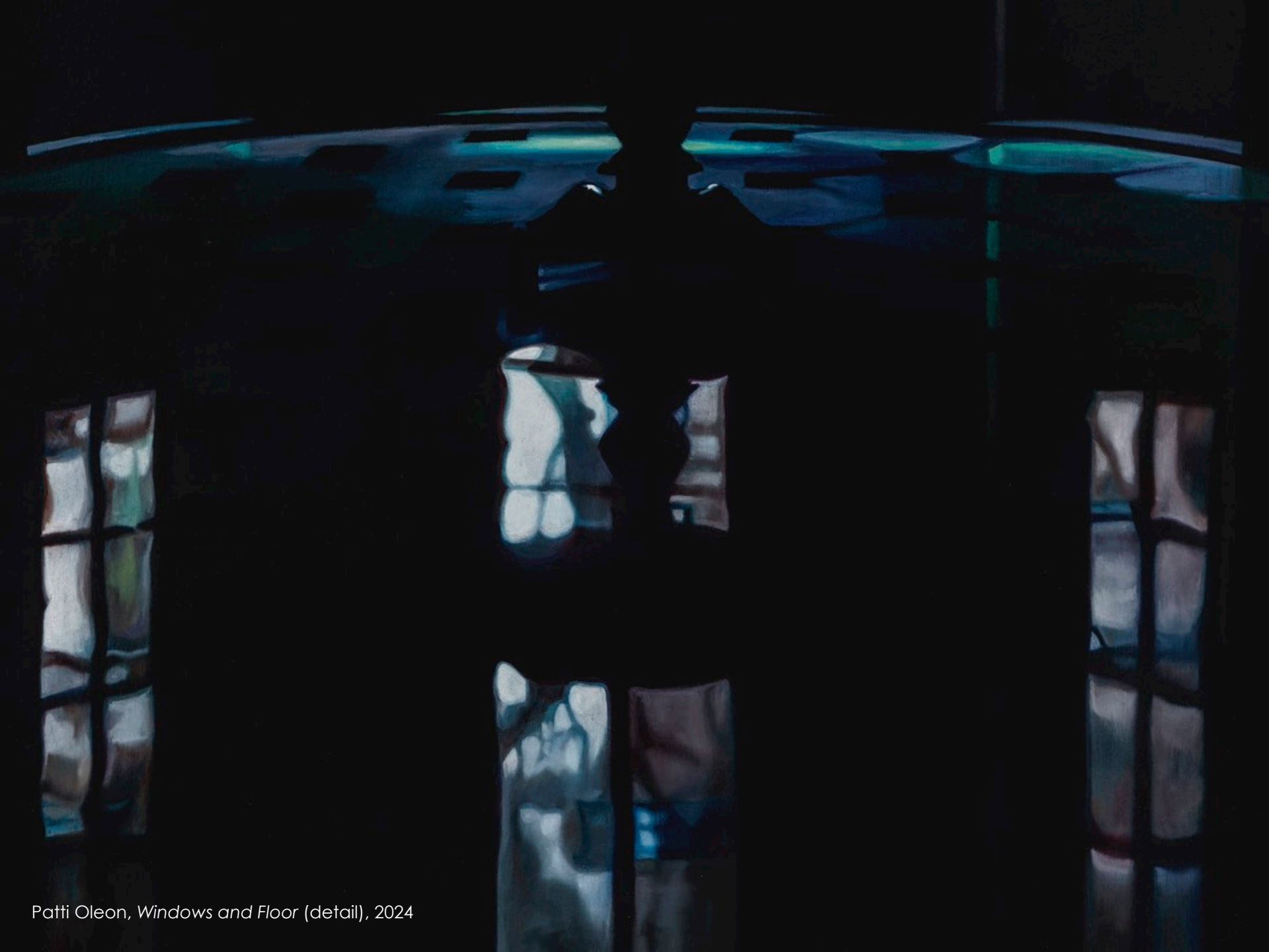
Patti Oleon, Windows and Floor (detail) , 2024