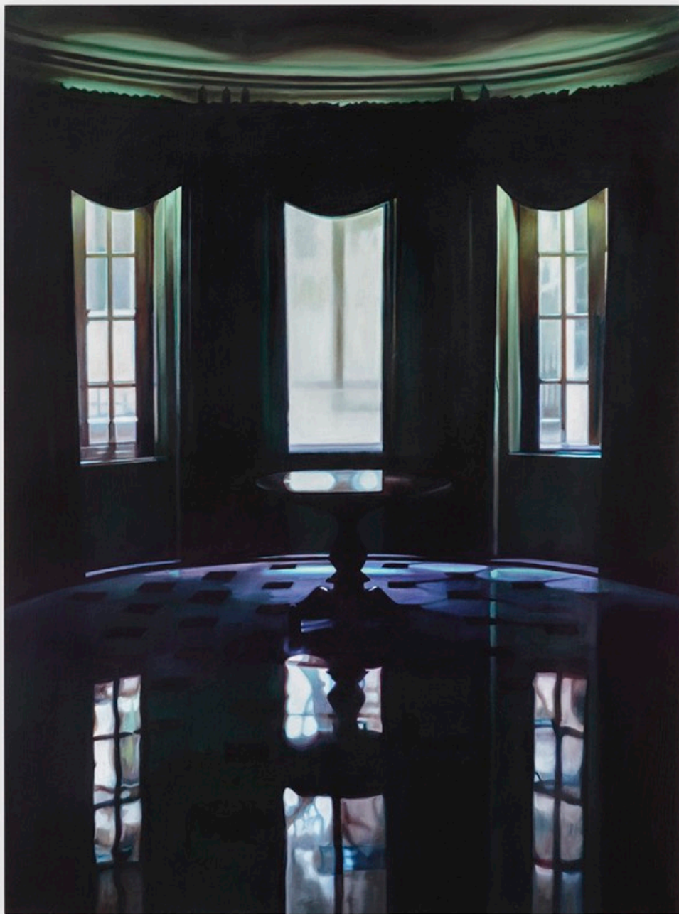
Patti Oleon Windows and Floor 2024 Oil on hardwood panel 40 x 30 in 101.60 x 76.20 cm PO-01