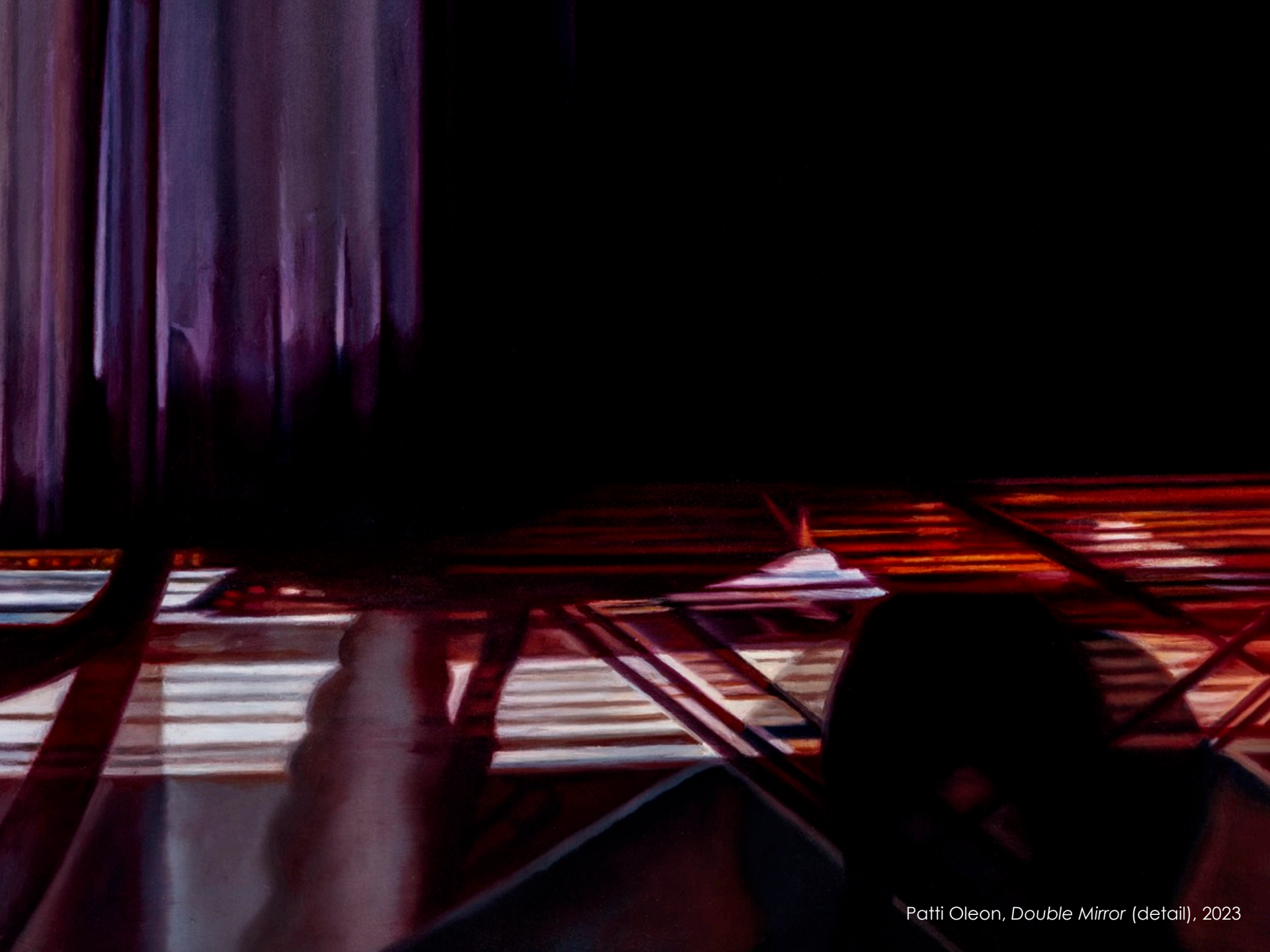
Patti Oleon, Double Mirror (detail), 2023