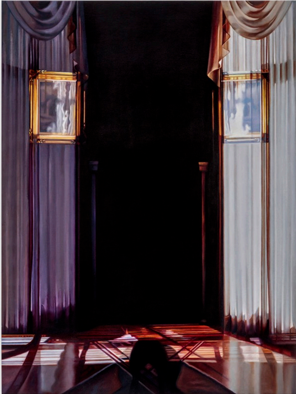
Patti Oleon Double Mirror 2023 Oil on linen over wood panel 40 x 30 in 101.60 x 76.20 cm PO-03