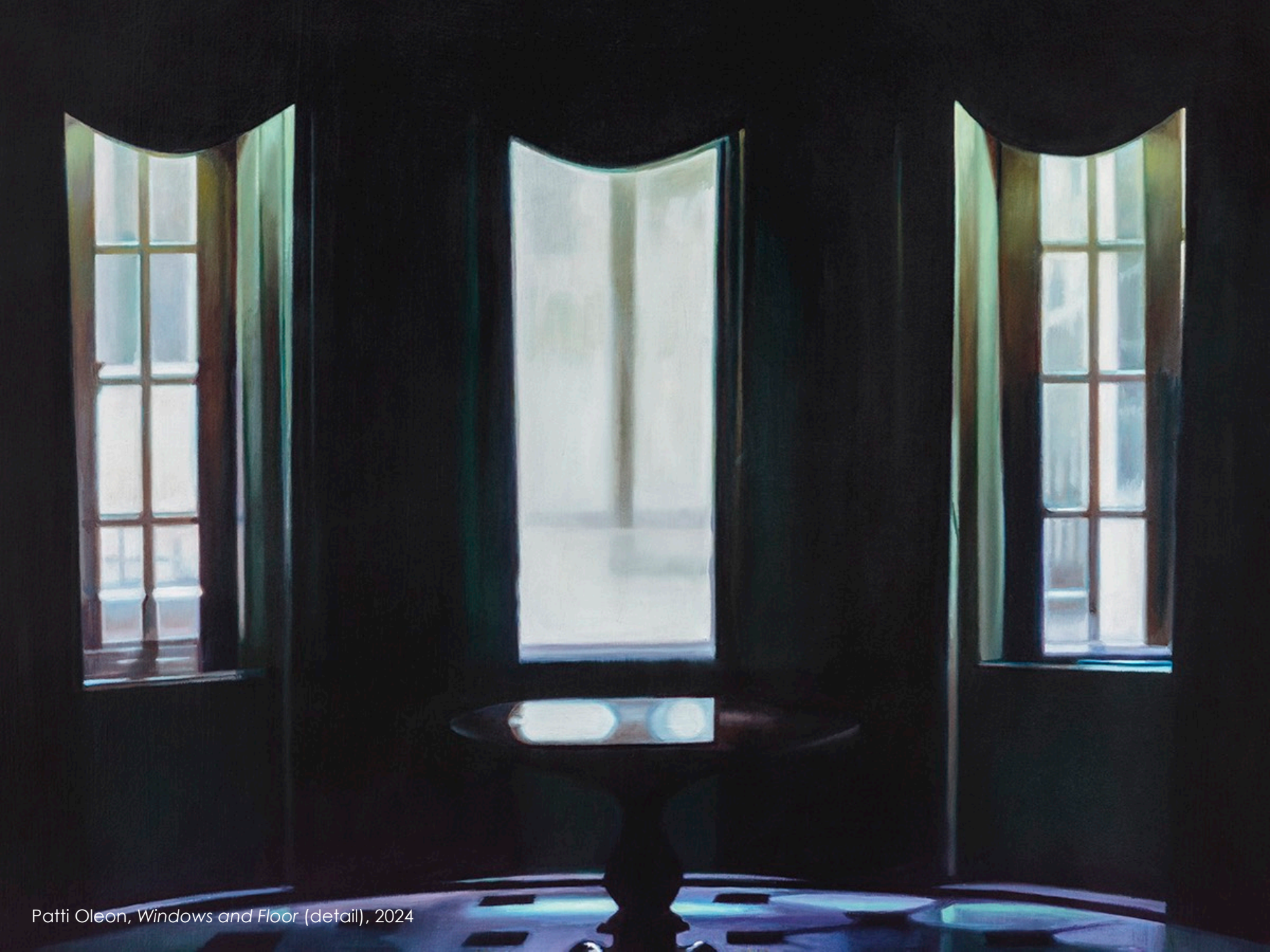
Patti Oleon, Windows and Floor (detail) , 2024