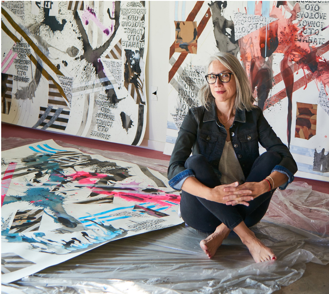
Alexandra Grant