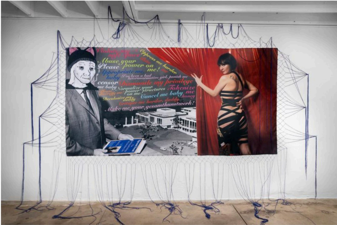
Freudian Slip 2022 © Molly Surazhsky