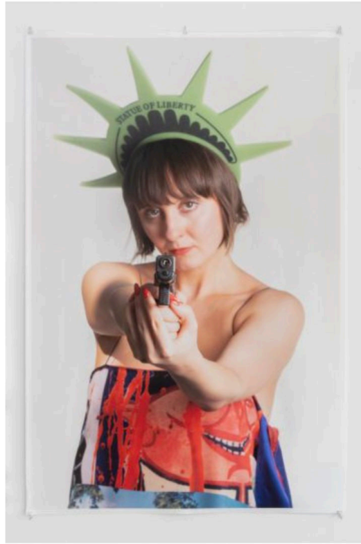
Miss Americhka 2022