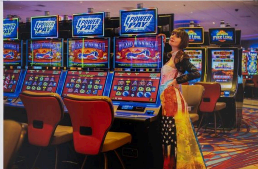
Croupier Realism 2022 © Molly Surazhsky – Courtesy Lowell Ryan Projects