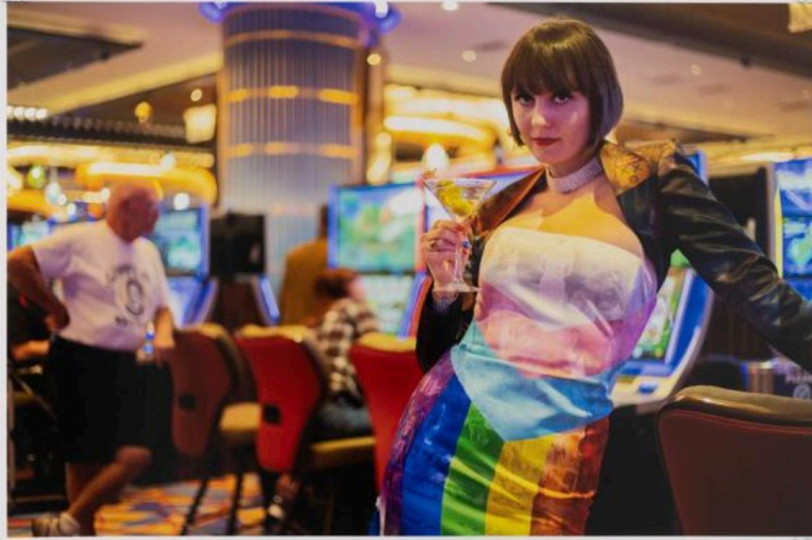
Caesar's Zombie Palace 2022