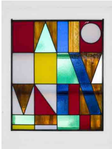
Antonio Adriano Puleo Inverno (Winter) 2022 Stained glass 24 ¾h x 20 ¾w inches 63h x 53w cm AAP-071