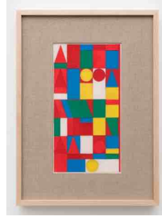
Antonio Adriano Puleo Mercoledì Studio (Wednesday Study) 2022 Flashe, oil, and collaged paper on paper with artist frame 18 ½h x 13 ½w inches 47h x 34.3w cm AAP-064