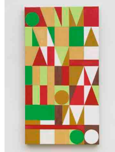
Antonio Adriano Puleo Dicembre (December) 2021 Oil and Flashe on canvas 28h x 15w inches 71.12h x 38.10w cm AAP-046