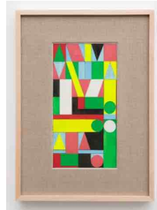
Antonio Adriano Puleo Giovedì Studio (Thursday Study) 2022 Oil, Flashe, pencil, and collaged paper on paper with artist frame 18 ½h x 13 ½w inches 47h x 34.3w cm AAP-066