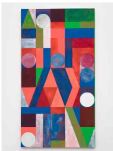
Antonio Adriano Puleo Martedì (Tuesday) 2022 Flashe on linen 84h x 45w inches 213.36h x 114.30w cm AAP-061