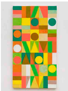
Antonio Adriano Puleo Luglio (July) 2021 Oil and Flashe on canvas 28h x 15w inches 71.12h x 38.10w cm AAP-053