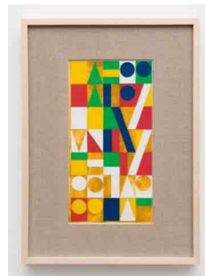
Antonio Adriano Puleo Venerdì Studio (Friday Study) 2022 Oil, Flashe, and collaged paper on canvas with artist frame 18 ½h x 13 ½w inches 47h x 34.3w cm AAP-068