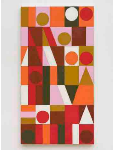
Antonio Adriano Puleo Maggio (May) 2021 Oil and Flashe on canvas 28h x 15w inches 71.12h x 38.10w cm AAP-055