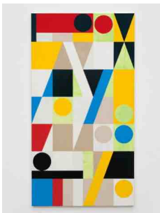
Antonio Adriano Puleo Lunedì (Monday) 2022 Oil and Flashe on canvas 84h x 45w inches 213.36h x 114.30w cm AAP-059