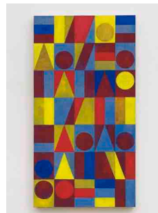
Antonio Adriano Puleo Aprile (April) 2021 Oil and Flashe on linen 28h x 15w inches 71.12h x 38.10w cm AAP-048