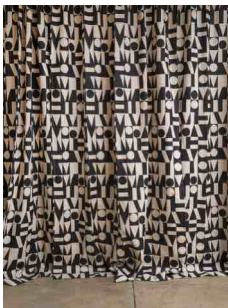
Antonio Adriano Puleo Una Cosa È Una Cosa - Le Tende 2022 Silk screen on linen 98h x 54w inches 249h x 137w cm AAP-076