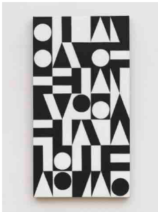
Antonio Adriano Puleo Gennaio (January) 2021 Oil and Flashe on canvas 28h x 15w inches 71.12h x 38.10w cm AAP-045