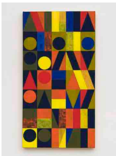
Antonio Adriano Puleo Marzo (March) 2021 Oil and Flashe on canvas 28h x 15w inches 71.12h x 38.10w cm AAP-054