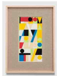
Antonio Adriano Puleo Lunedì Studio (Monday Study) 2022 Flashe, oil, and collaged paper on paper with artist frame 18 ½h x 13 ½w inches 47h x 34.3w cm AAP-060