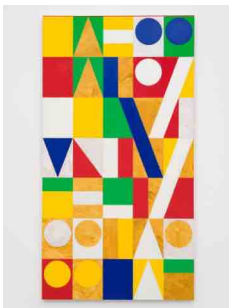
Antonio Adriano Puleo Venerdì (Friday) 2022 Oil and Flashe on canvas 84h x 45w inches 213.36h x 114.30w cm AAP-067