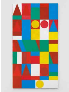
Antonio Adriano Puleo Mercoledì (Wednesday) 2022 Oil and Flashe on linen 84h x 45w inches 213.36h x 114.30w cm AAP-063