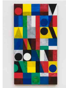
Antonio Adriano Puleo Giugno (June) 2021 Oil and Flashe on canvas 28h x 15w inches 71.12h x 38.10w cm AAP-052