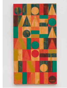
Antonio Adriano Puleo Ottobre (October) 2021 Oil and Flashe on canvas 28h x 15w inches 71.12h x 38.10w cm AAP-047