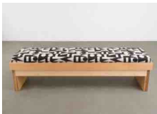
Antonio Adriano Puleo Una Cosa È Una Cosa - Panca 2022 Maple with high dense foam cushion 20h x 72w x 16d inches 51h x 183w x 40.6d cm edition 1 of 3 / 2 AP AAP-078