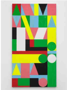
Antonio Adriano Puleo Giovedì (Thursday) 2022 Oil, Flashe, ink, and collaged canvas on canvas 84h x 45w inches 213.36h x 114.30w cm AAP-065