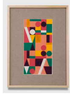
Antonio Adriano Puleo Domenica Studio (Sunday Study) 2022 Flashe, oil, and collaged paper on paper with artist frame 18 1/2h x 13 1/2w inches 47h x 34.3w cm AAP-058