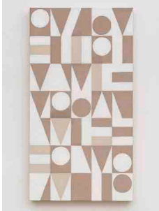
Antonio Adriano Puleo Novembre (November) 2021 Oil on linen 28h x 15w inches 71.12h x 38.10w cm AAP-050