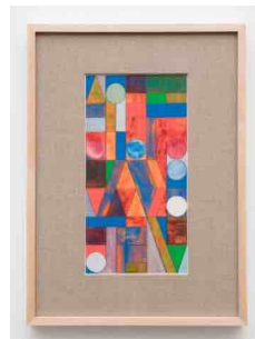
Antonio Adriano Puleo Martedì Studio (Tuesday Study) 2022 Flashe, pencil, and collaged paper on paper with artist frame 18 ½h x 13 ½w inches 47h x 34.3w cm AAP-062