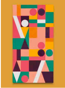
Antonio Adriano Puleo Domenica (Sunday) 2022 Oil and Flashe on canvas 42h x 22 1/2w inches 106.68h x 57.15w cm AAP-057