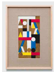
Antonio Adriano Puleo Sabato Studio (Saturday Study) 2022 Flashe, watercolor, and pencil on paper with artist frame 18 ½h x 13 ½w inches 47h x 34.3w cm AAP-070