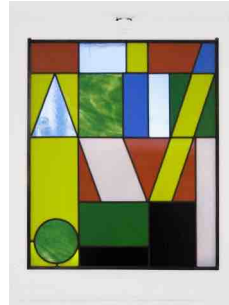
Antonio Adriano Puleo Primavera (Spring) 2022 Stained glass 24 ¾h x 20 ¾w inches 63h x 53w cm AAP-072