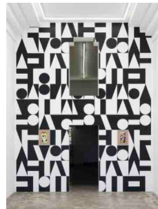
Antonio Adriano Puleo Una Cosa È Una Cosa - Murale 2022 Latex paint 17h x 14w feet 5.18h x 4.26w meters AAP-075