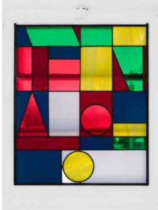
Antonio Adriano Puleo Estate (Summer) 2022 Stained glass 24 ¾h x 20 ¾w inches 63h x 53w cm AAP-073