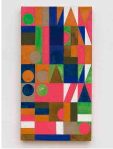
Antonio Adriano Puleo Settembre (September) 2021 Oil and ink on linen 28h x 15w inches 71.12h x 38.10w cm AAP-049