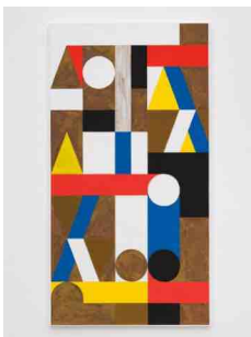
Antonio Adriano Puleo Sabato (Saturday) 2022 Oil, Flashe, and marble dust on canvas 84h x 45w inches 213.36h x 114.30w cm AAP-069