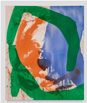
Will Bentsen Hero Worship: My Epistemic Curiosity 2022 Acrylic on canvas 72h x 60w in 182.88h x 152.40w cm WB-031