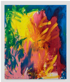
Will Bentsen Jackpot 2022 Acrylic on canvas 72h x 60w in 182.88h x 152.40w cm WB-034