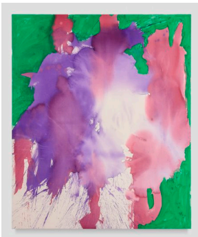
Will Bentsen El Dorado 2022 Acrylic on canvas 72h x 60w in 182.88h x 152.40w cm WB-030