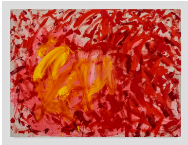
Will Bentsen In the Grip 2022 Acrylic on canvas 72h x 96w in 182.88h x 243.84w cm WB-037