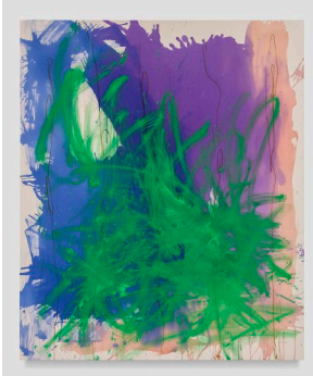
Will Bentsen Soft Landing 2022 Acrylic on canvas 72h x 60w in 182.88h x 152.40w cm WB-032