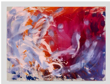
Will Bentsen Nightshade 2022 Acrylic on canvas 72h x 96w in 182.88h x 243.84w cm WB-038