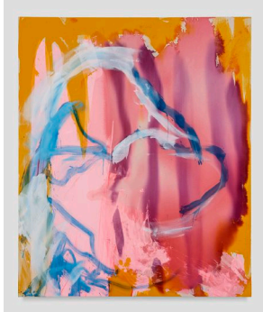
Will Bentsen A General Violation of Expectation 2021 Acrylic on canvas 72h x 60w in 182.88h x 152.40w cm WB-035