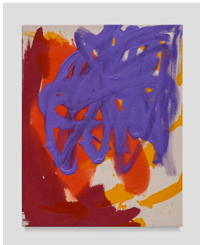
Will Bentsen Color Study (Prize for the Taking) 2022 Acrylic on canvas 25h x 20w in 63.50h x 50.80w cm WB-039