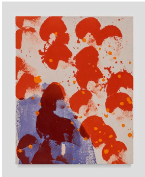
Will Bentsen Color Study (Desert Bloom) 2022 Acrylic on canvas 25h x 20w in 63.50h x 50.80w cm WB-040