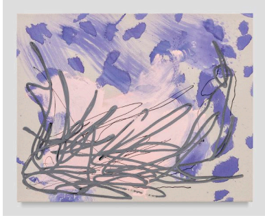
Will Bentsen Lavender Under Pink With Gray Over Black (I Know, Right?) 2022 Acrylic on canvas 20h x 25w in 50.80h x 63.50w cm WB-041