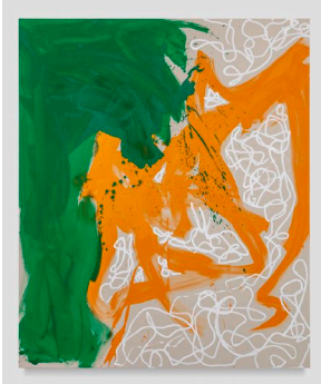
Will Bentsen The Blind Courage of Youth 2022 Acrylic on canvas 72h x 60w in 182.88h x 152.40w cm WB-033